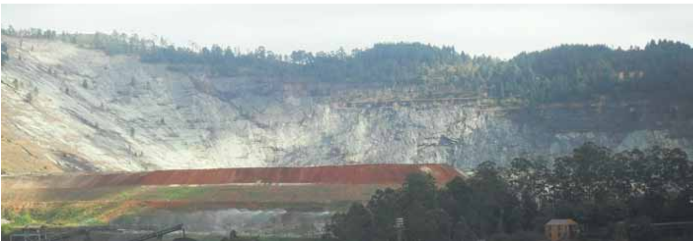
Figure 3. Photograph of the Morro da Pousada landscape. Note the old Pico do Cauê excavation and the ore industry in operation.

word to describe the landscape observed at each viewpoint. The words were: