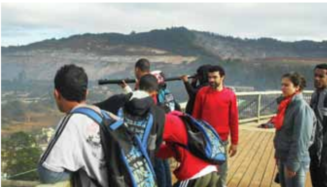
Figure 8. Site photographs—The History, Science and Geography teachers and students.

guidelines referring to environmental degradation and changes to the city's ecology and landscapes. Based on the landscape aspects available on the form, students were given the task of noting which aspects had suffered alterations and to what level.