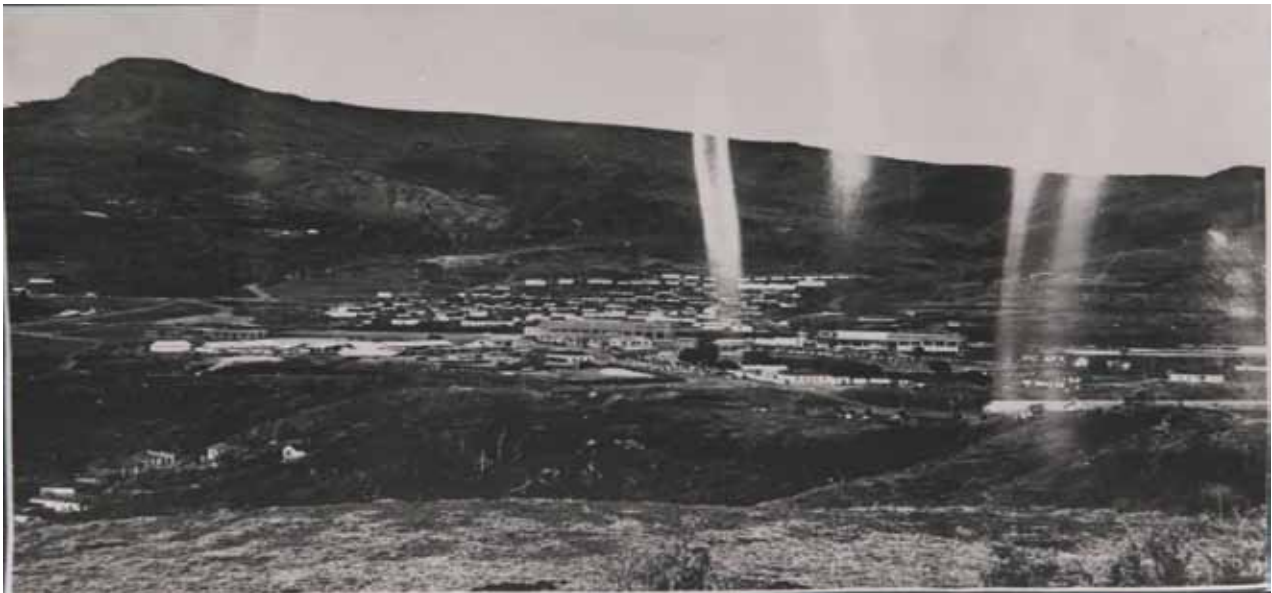
Figure 4. Old photograph of the Pico do Cauê in 1932, before mineral extraction.

place an emphasis on the practical and statistical gains that the task contributes to the research.