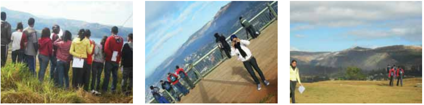
Figure 5. Site photographs.

this, it can be seen that the scale is very useful for quantitatively highlighting subjective and qualitative observations. The name of the scale is a homage by one of the participants in the project to the poet Carlos Drummond de Andrade, who lived through and suffered alterations to the landscape of a city that experienced the devastating power of mining companies 5 . It is worth highlighting that the largest scale landscape alteration perceived by the illustrious poet and by the oldest inhabitant was the complete destruction of the Pico do Cauê, nowadays called the Cauê mine—which is a large opening in the ground with a width and depth of several metres, and which can be easily seen from the “Morro da Pousada” viewpoint that was visited.