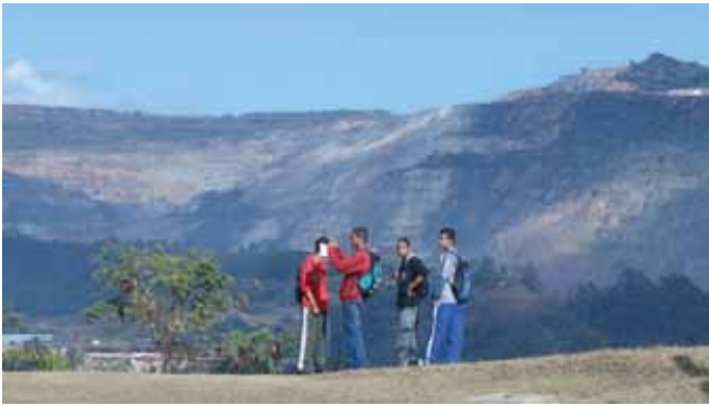
Figure 6. Site photographs.