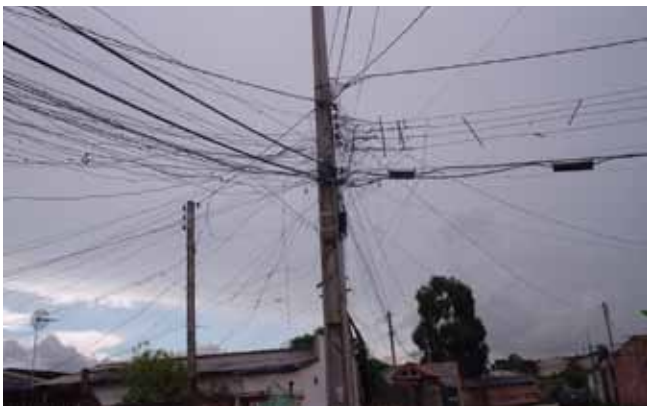
Makeshift Water Lines Improvised by Community Residents