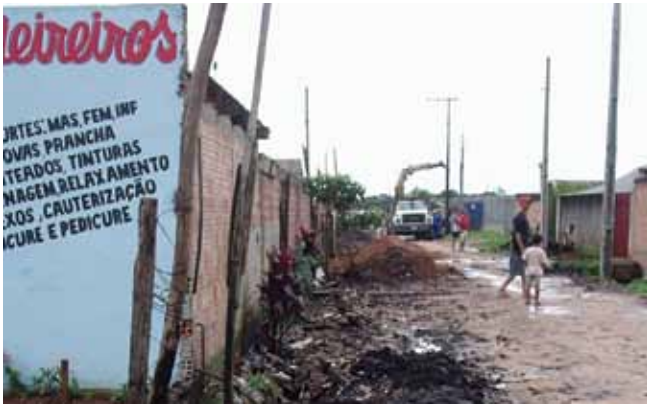
Makeshift Water Lines Improvised by Community Residents