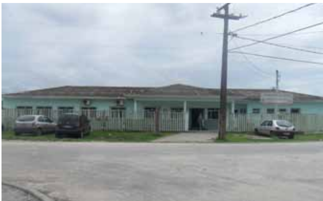
Day Care Center, capacity for 150 children.