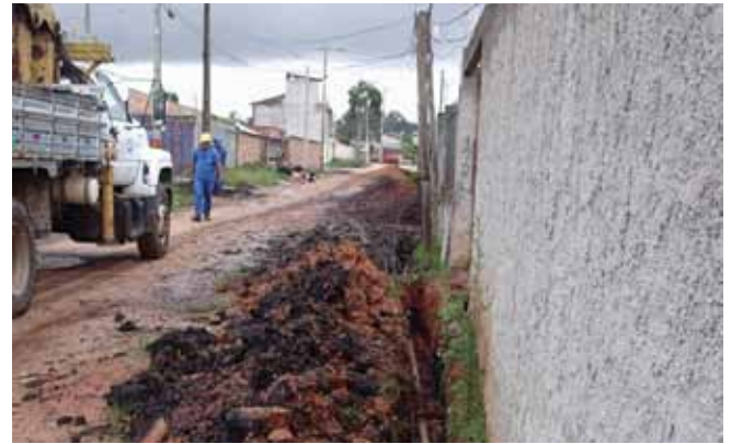
Implementation of Formal Water System.