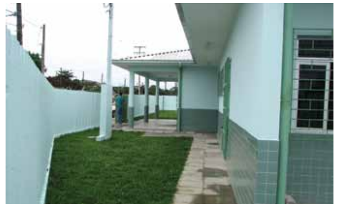
New Health Care Center