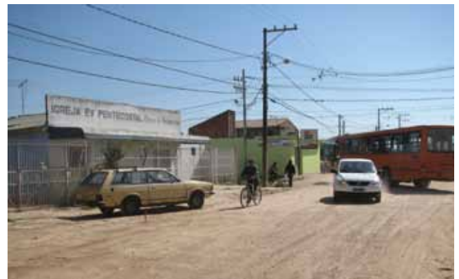
Implementation of Formal Water System