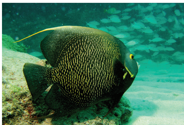
Figure 5. Marine life at Abrolhos Marine National Park.

Tourism is another significant economic activity, involving approximately 80,000 people in the Bahia sector of Abrolhos. The tourists mainly come to the region for its natural attractions, such as the beauty of its beaches, reefs and mangrove forests and the remaining Atlantic Forest (PRODETUR NE II 2003). As for fishing, the environment is pivotal for the creation of jobs and income for the local communities.