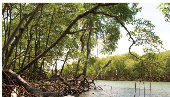
Figure 3. Mangroves from Cassurubá Extractive Reserve (Caravelas, Bahia).