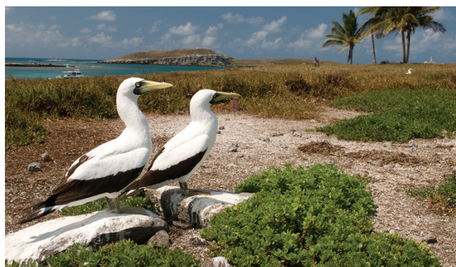
Figure 4. Boobies marine birds in the Abrolhos Archipelago.